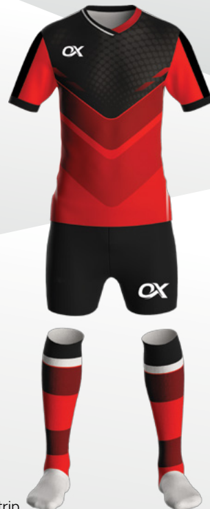
OX # 01-103