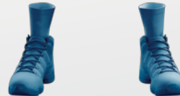
OX # 01-107