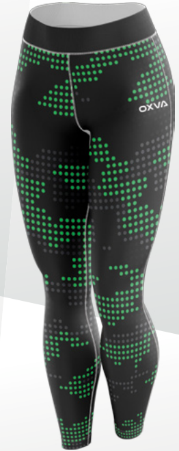
OX # 01-123