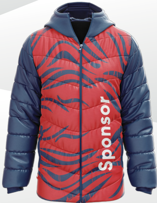
OX # 01-141