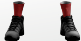
OX # 01-108