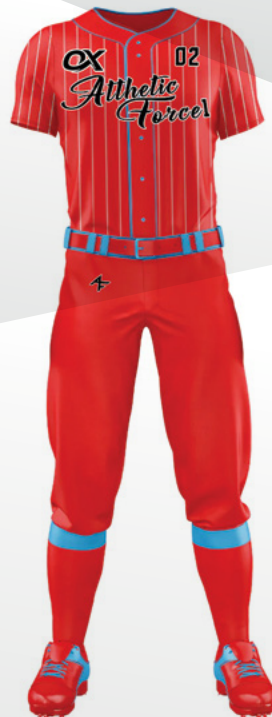
OX # 01-11