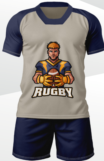
OX # 01-118