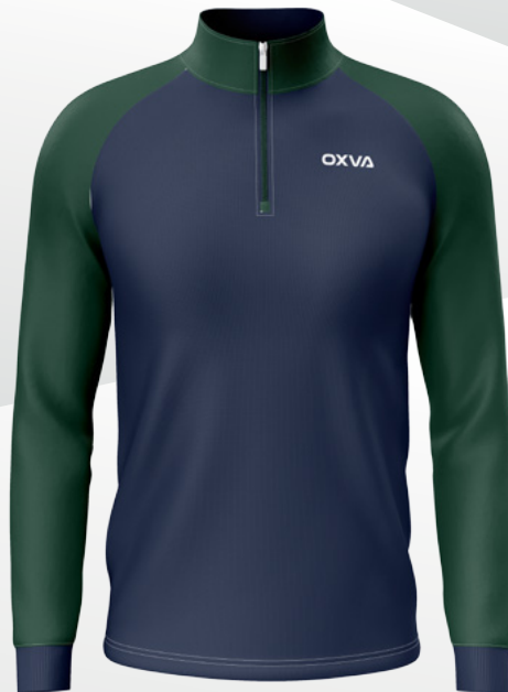
OX # 01-144