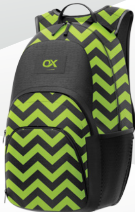
OX # 01-148