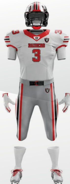
OX # 01-115