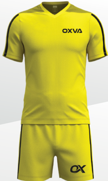
OX # 01-102