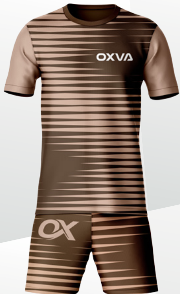
OX # 01-101