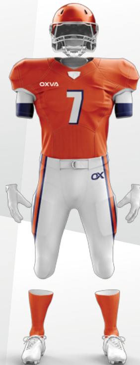
OX # 01-116