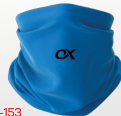
OX # 01-153