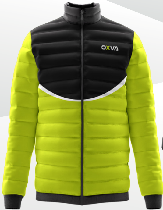
OX # 01-138