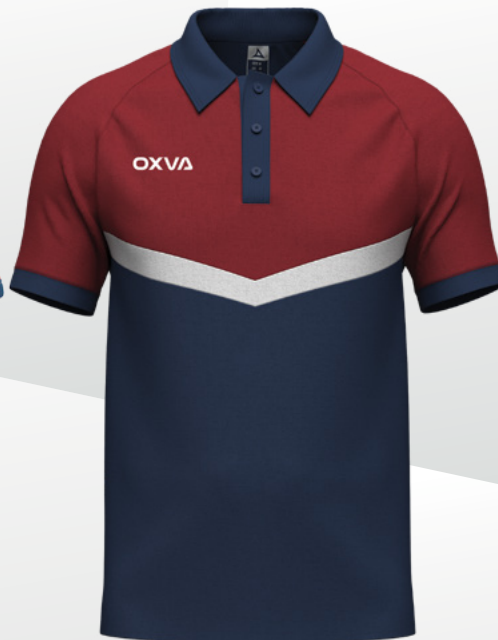
OX # 01-130