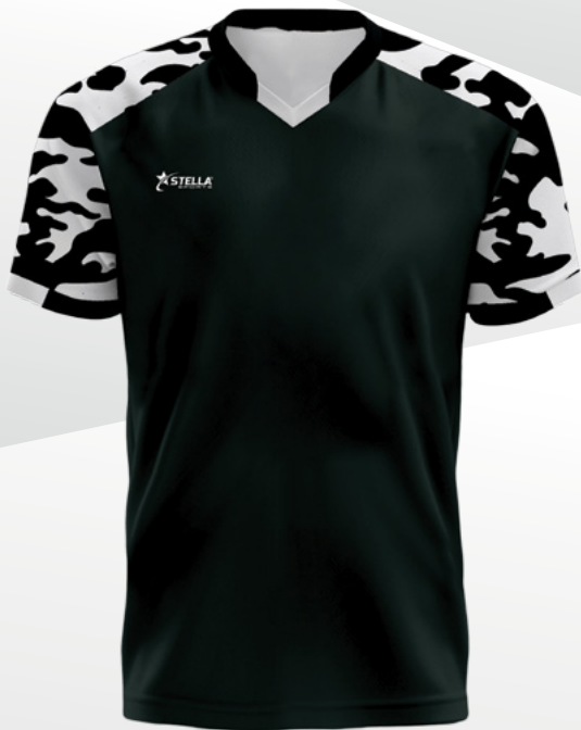
OX # 01-132