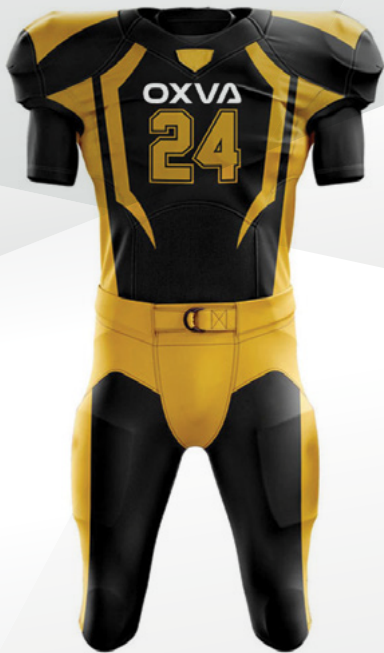
OX # 01-113