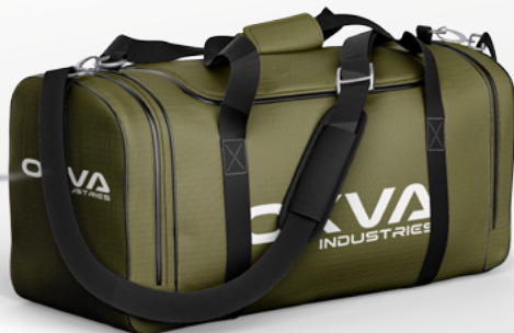
OX # 01-149