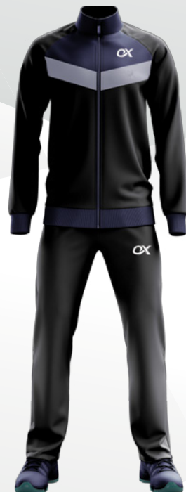
OX # 01-127