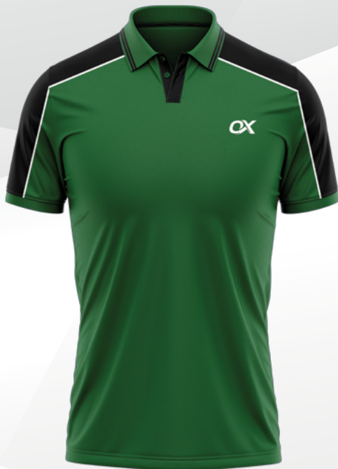
OX # 01-128