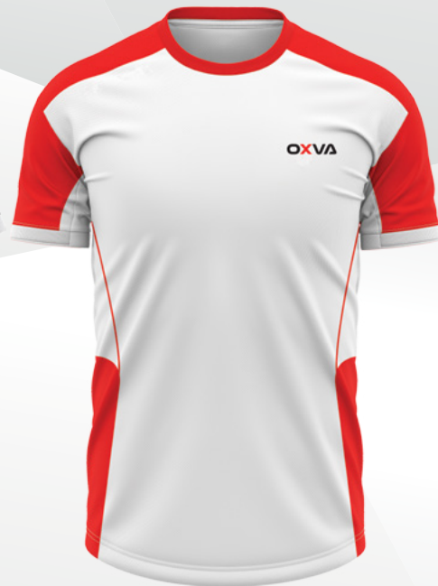
OX # 01-133