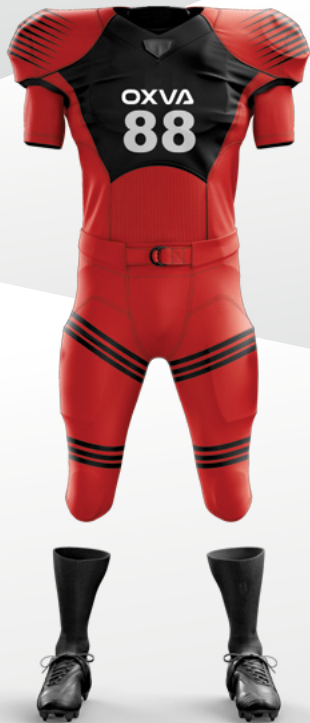
OX # 01-114