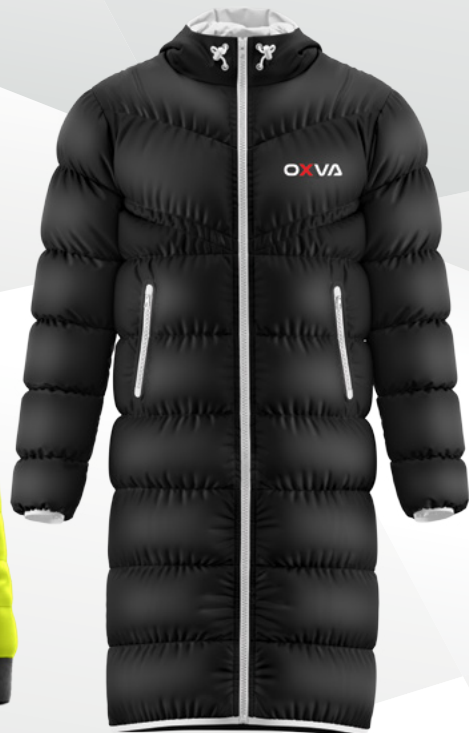
OX # 01-139