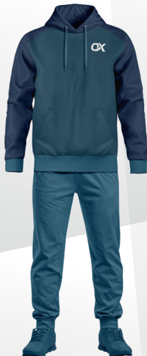
OX # 01-124