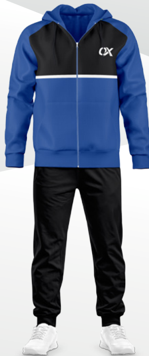
OX # 01-126