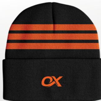
OX # 01-150