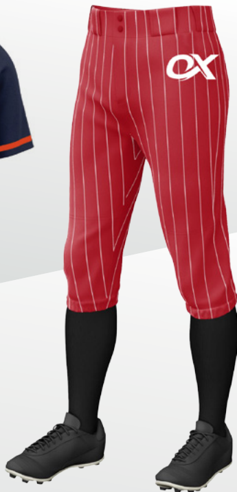
OX # 01-110