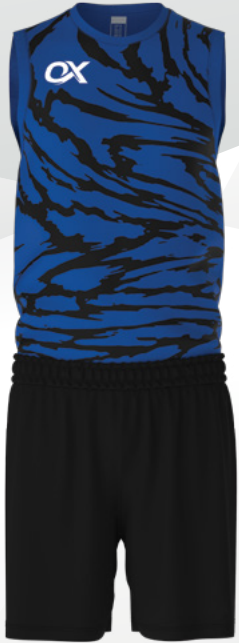
OX # 01-105