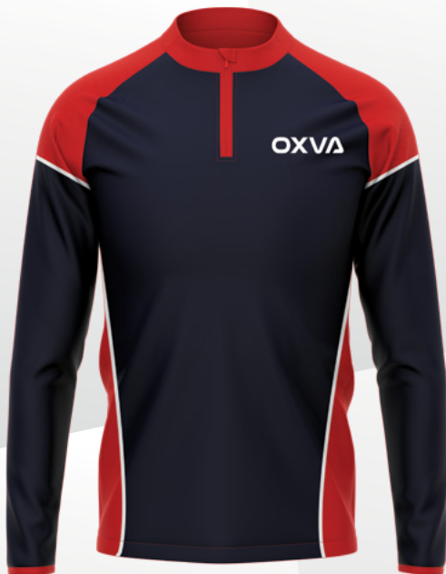
OX # 01-143