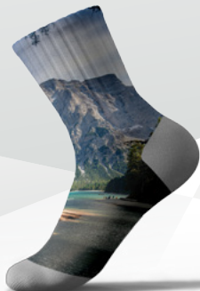
OX # 01-146