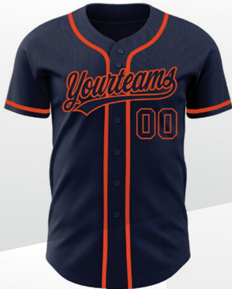
OX # 01-109