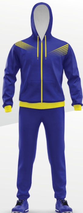
OX # 01-125