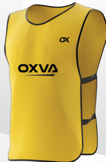
OX # 01-152