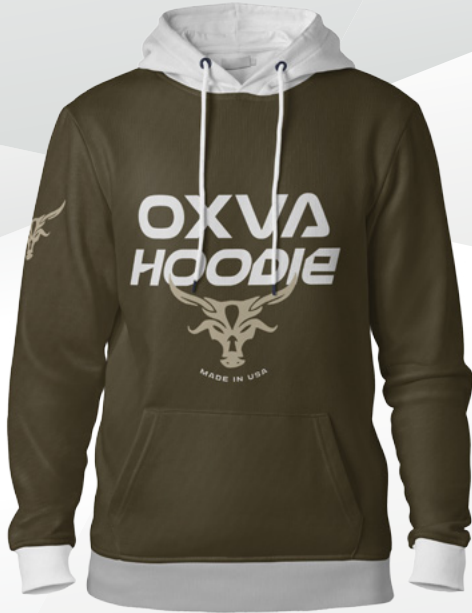
OX # 01-134