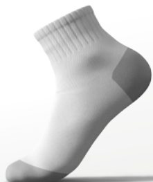
OX # 01-147