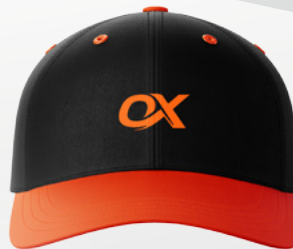
OX # 01-151