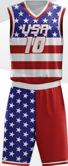
OX # 01-106