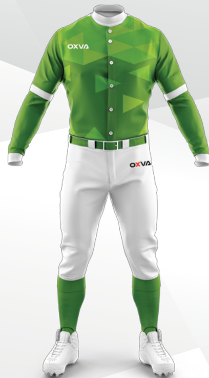
OX # 01-112