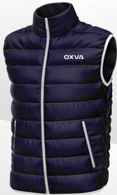
OX # 01-142