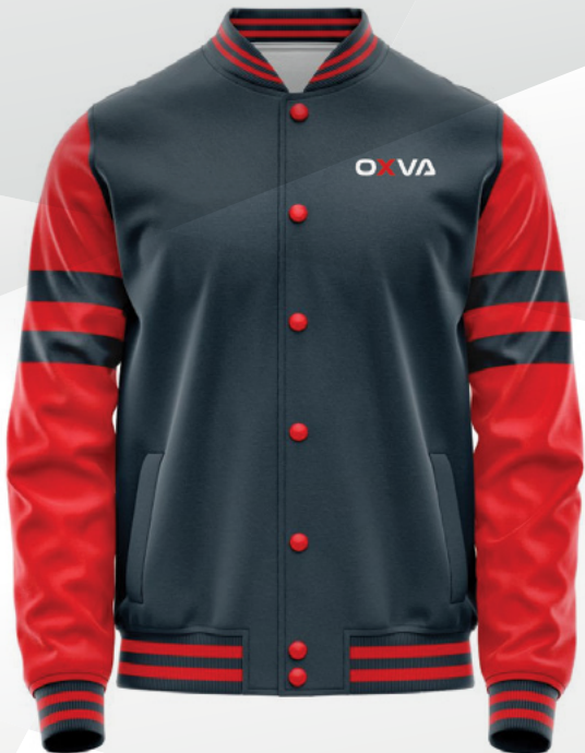
OX # 01-140