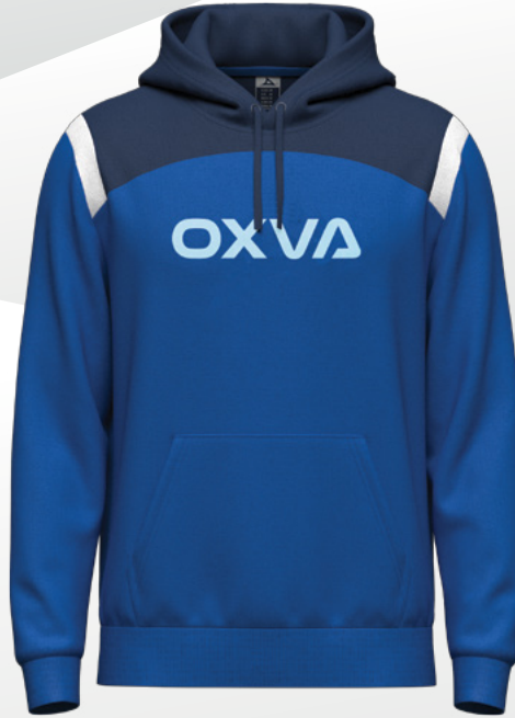
OX # 01-135