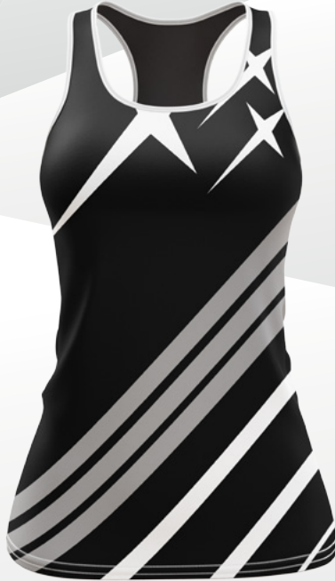
OX # 01-121