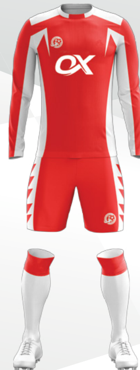
OX # 01-104