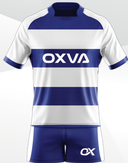
OX # 01-119