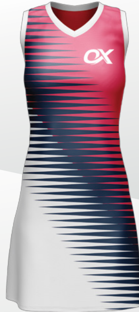
OX # 01-122