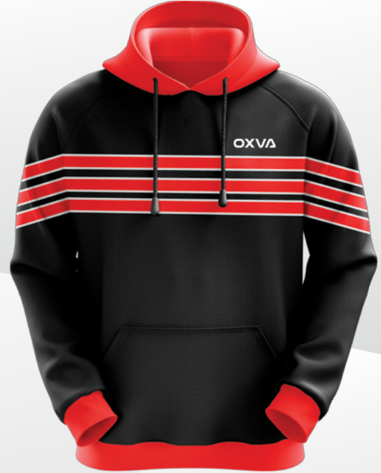
OX # 01-136