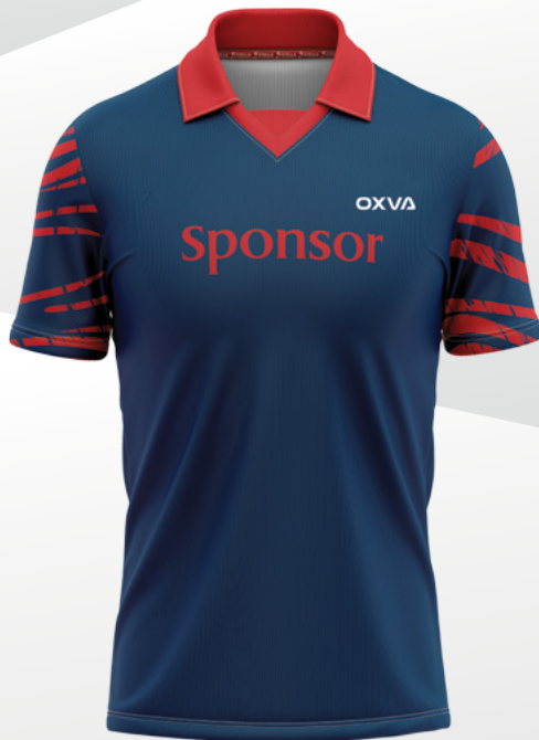
OX # 01-129