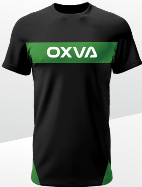
OX # 01-131