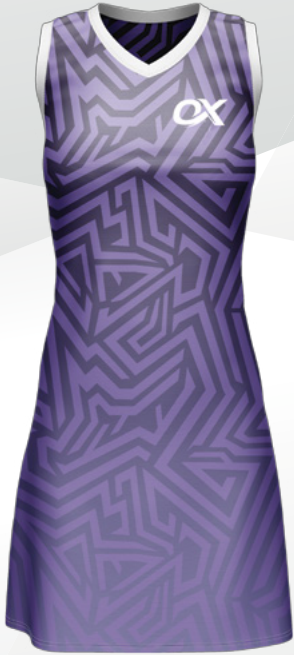
OX # 01-120