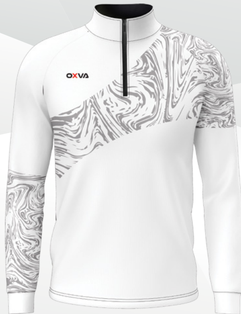
OX # 01-145