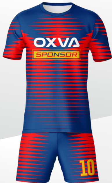
OX # 01-117