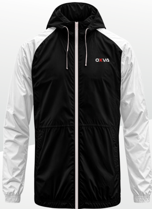
OX # 01-137